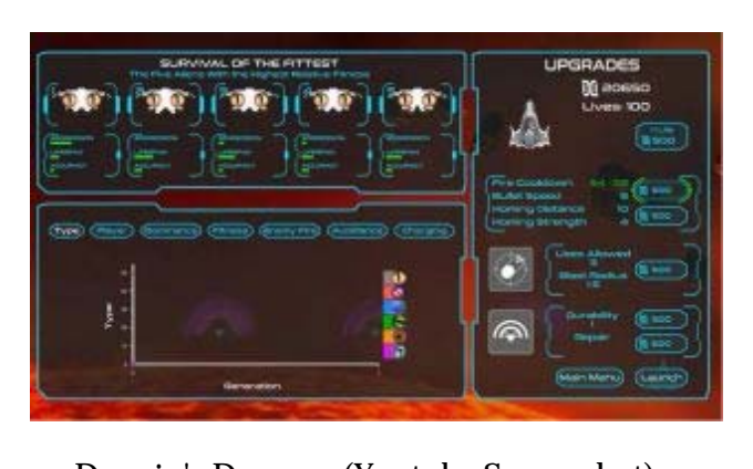
Darwin's Demons (Youtube Screenshot)

A new video game, Darwin's Demons (https://youtu.be/iKBMY0vcDj4), claims to demonstrate Darwinian evolution. But Darwin's Demons only adapt. And there is a difference between undirected Darwinian evolution and designed adaptation. The name Darwin's Demons is scientism's seductive labeling intended to imply otherwise.